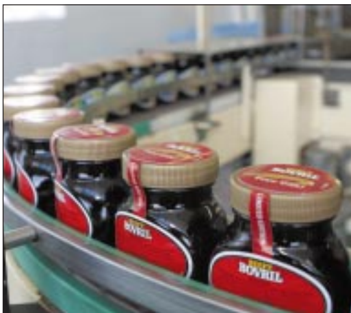
SFI manufactures top brands for blue-chip customers.

In terms of operational standards, SFI is contracted to major multinational-